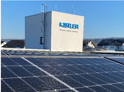
Image material (reprinting free of charge provided that the Kistler Group image source is quoted)

A photovoltaic system was installed on the roof of the Kistler building in Straubenhardt at the beginning of 2023. Since then, the system has produced more than 35,000 kWh of electricity. It is expected to produce 60,000 kWh on average every year.