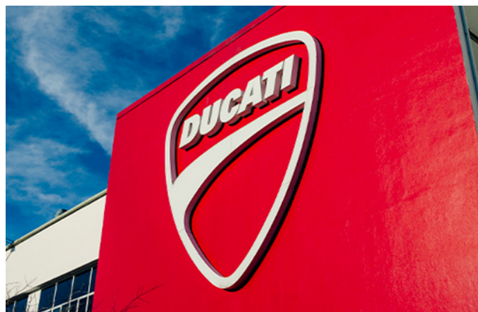
High-performance engine development: The iconic Ducati logo on the façade of the company's headquarters in Borgo Panigale, Bologna.

The 6054C piezoelectric cylinder pressure sensor from Kistler delivers thermal stability up to 350°C and a frequency response exceeding 100 kHz, capturing even the smallest pressure fluctuations inside the cylinder – including during the fastest transients. Its high accuracy and signal repeatability allow engineers to spot combustion irregularities with precision, helping prevent knock events and premature component wear. This makes in-cylinder pressure measurement a critical tool not only for engine calibration, but also for tracking reliability over the engine's lifetime. The data gathered by Kistler sensors enables Ducati to evaluate combustion quality and cycle efficiency, ensuring stable, repeatable performance.