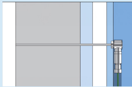
Fig. 2: Graphic of the positioning of indirect sensors