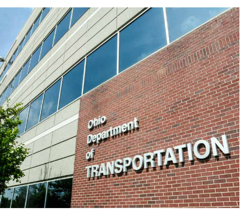
Headquarters of Ohio Department of Transportation (ODOT) in Columbus

The US state of Ohio is stepping up its efforts to collect traffic data so that it can claim important Federal budget funding to conserve infrastructure. Kistler Lineas sensors achieved exceptionally convincing results in the state's tests on Weigh In Motion systems.