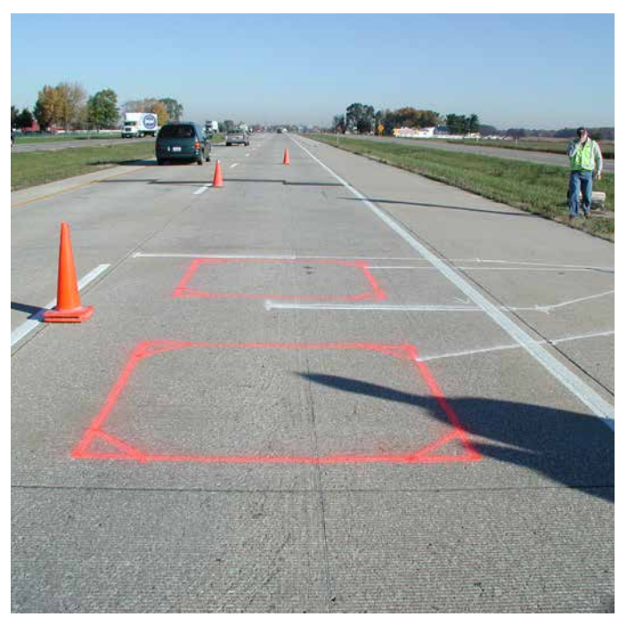
ODOT currently operates 22 Weigh In Motion stations – and is planning to add more in the coming years