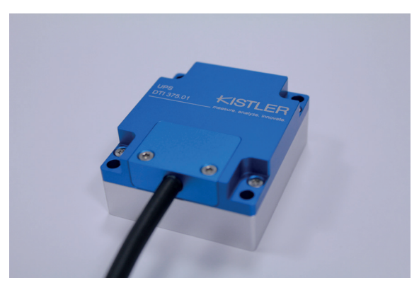
Fig. 1: Type DTI375.01 UPS with Type DTI375.12 recorder cabling